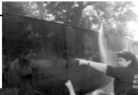
A Father's Day Activity — members and volunteers Wash the Wall