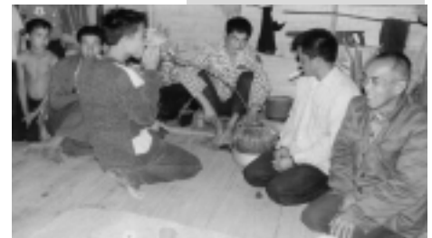
My Lao interpreter takes his turn with the homemade brew.

Yes, there will be some emotion, but know that many 'sons and daughters' will quickly become familiar faces, and rest assured... you won't be alone! ♦