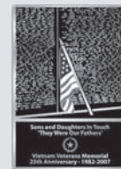
The 2007 SDIT Vietnam Memorial 25th Anniversary Commemorative Lapel Pin